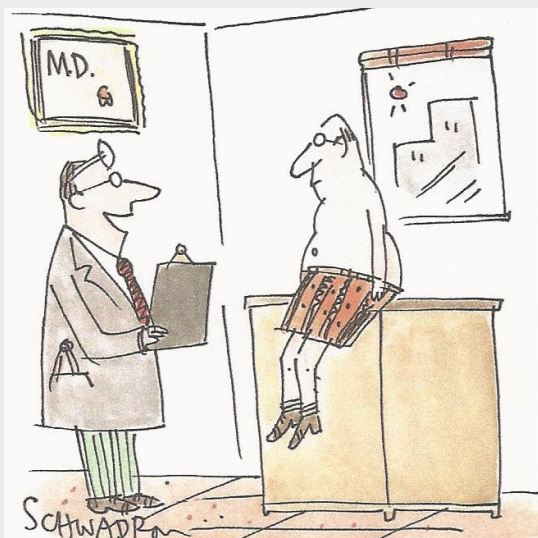
"Good news. Your cholesterol has stayed the same, but the research findings have changed."